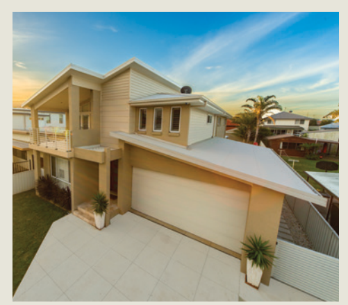
Roof, gutter, fascia & downpipe colour: Surfmist®

Now with Activate™ technology, this industry leading coating technology enhances the protective coating of the substrate of COLORBOND® steel.